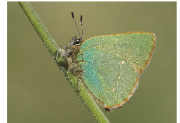
Green Hairstreak

Butterflies are a familiar sight in the summer months across Scotland. Some use a wide range of habitats (generalists) – these include species such as meadow brown and small tortoiseshell, commonly found throughout Scotland. Others are specialists that are more restricted and may be found only in one specific habitat such as large heath, which is typically a wetland species. Butterflies are relatively well-recorded, which enables their population trends to be assessed. Changes in their numbers over the years can provide an indication of habitat loss and fragmentation, and the impacts of climate change.